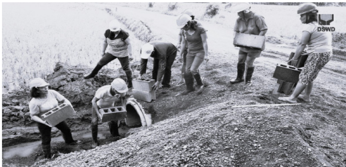
Apart from providing a platform for women to lead in the management of community sub-projects, the Department of Social Welfare and Development’s (DSWD) Kapit-Bisig Laban sa Kahirapan – Comprehensive and Integrated Delivery of Social Services (KALAHI-CIDSS) program also encourages women volunteers to participate in paid labor to expand the range of activities they can engage in.